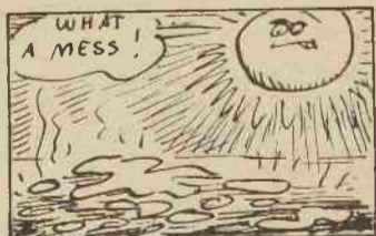
Some people used to think gold was created by leaving mercury in the sun.

Other resolutions passed by the Student Nurses' Association of North Carolina in February, 1978 include support of the Governor's Statement RE: immunization of school-age children and drug abuse education in the public schools. The association is also supporting the North Carolina State Nurses' Association efforts to increase the number of nurses serving on health decision making committees such as the Professional Standards Review Organization.