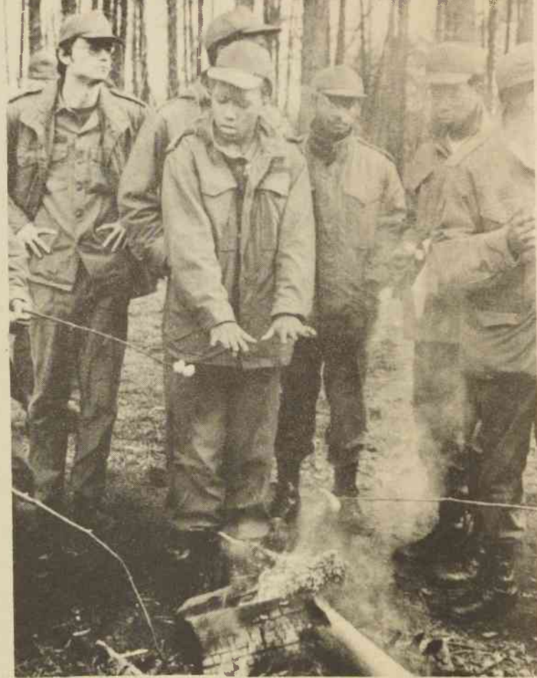
ROTC members ' get back to nature' while in the wilderness during recent field trip.