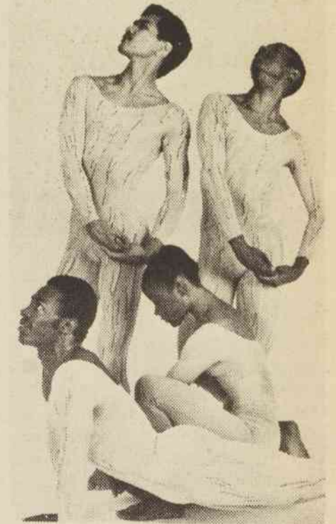
Alvin Ailey Ensemble

Lyceum Committee and professional director of a number of Winston-Salem State plays, says "Ailey's Ensemble is one of the major dance companies to perform at City Center in New York." City Center, an old art center, is one of the major dance