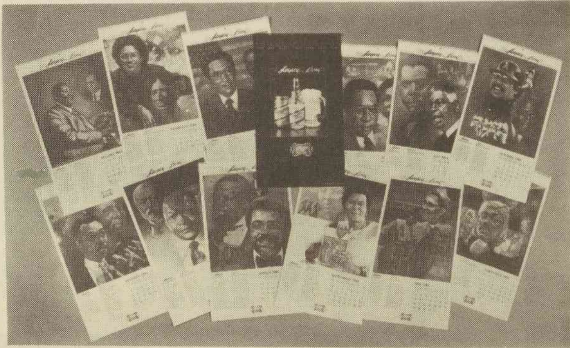
The twelve 1984 monthly calendars by Miller Brewing Company. The calendars are of living black heroes, heroines and pioneers.

Miller is an operating company of Philip Morris Incorporated. Principal beer brands include Miller High Life, Lite, Lowenbrau, Magnum and Meister Brau.