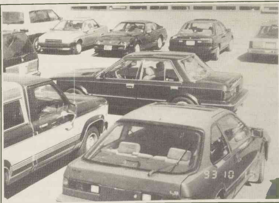
Car drivers park their car in any available space

During the day, the worst and most congested areas to park are near Hall-Patterson, R. J. Reynolds and the C.E.