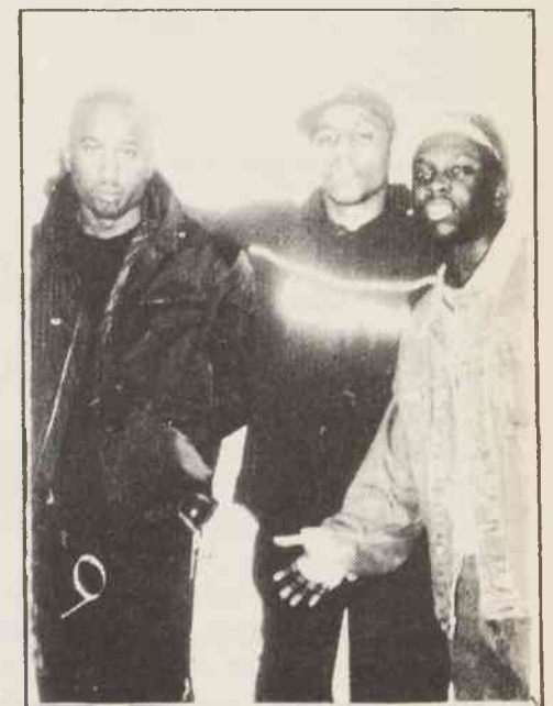
A Tribe Called Quest

Ram Jam '96 definitely was a crowd pleaser. Ram family members only hope Ram Jam '97 will be "da bomb" too.