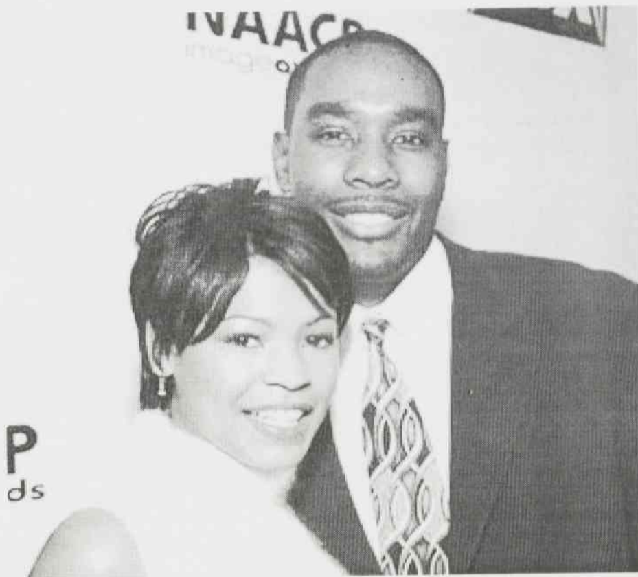
Nia Long and Morris Chestnut gives outstanding performances in box office film The Best Man.

She will join past honorees Will Smith, Oprah Winfrey, Whitney Houston, Denzel Houston, and Kenneth "Babyface" Edmonds. In August 1999, Berry undertook the challenge of executive producing and starring in the highly anticipated film of legendary screen icon Dorothy Dandridge in Introducing Dorothy Dandridge . Berry will next star in the action movie X-Men .