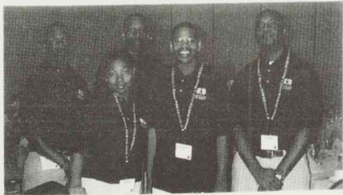
After a quick breakfast, the team gets ready for an early morning match.