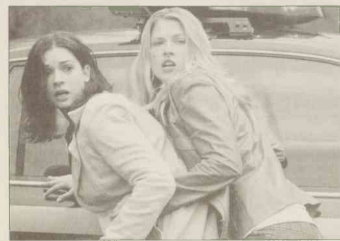
Darkness Falls (top) and Final Destination 2 (above) are two scary movies in theaters now.