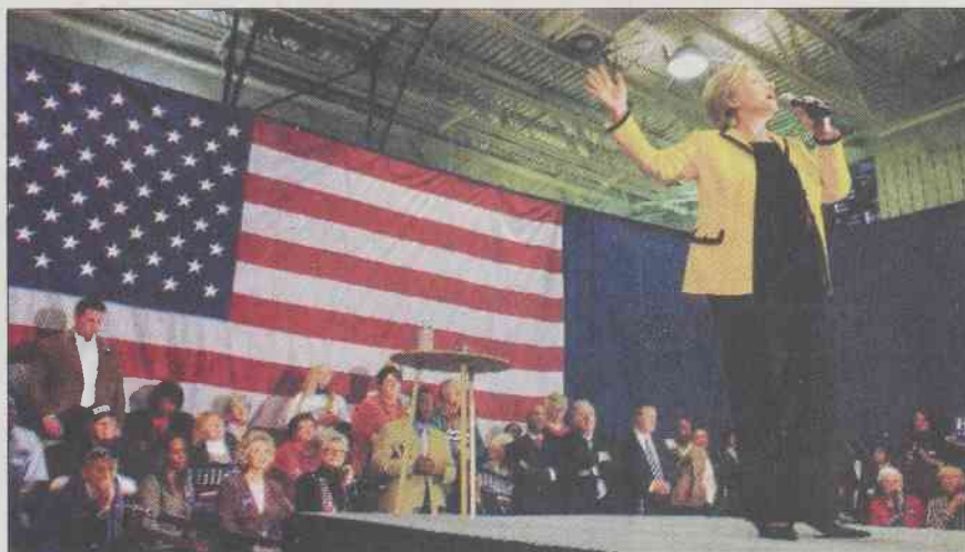
ABOVE: With primary wins in Iowa and South Carolina, Barack Obama has chance at becoming the first African-American President in the U.S. BELOW: Hillary Clinton speaks to supporters at a rally for her presidential campaign. Clinton won the New Hampshire primary.

plans to have her voice heard in the primary in May. She cites the caliber of the presidential candidates as the reason for her desire to vote this year.