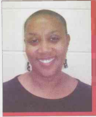
DIEDRE STEWART UNIVERSITY COLLEGE