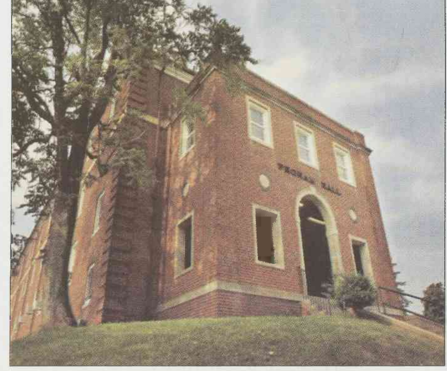
Pegram Hall houses 76 students making it the smallest dorm on

major from Charlotte, was a resident of Pegram her freshman year.