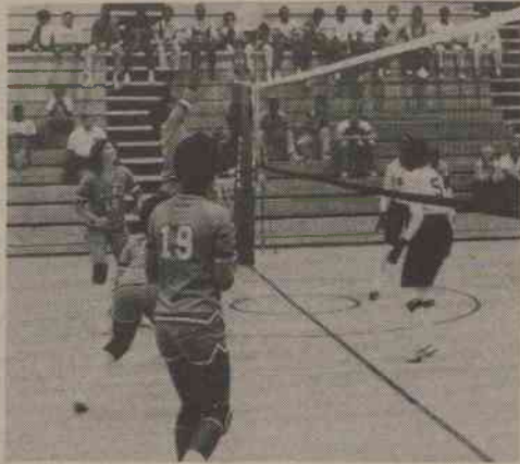
The Lady Braves played great volleyball during 1984 and just missed winning the regional tournament, finishing the runner-up. They face one of their toughest schedules this fall.