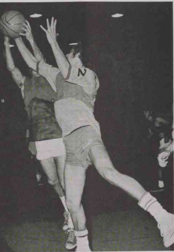
Action during Intramural Game