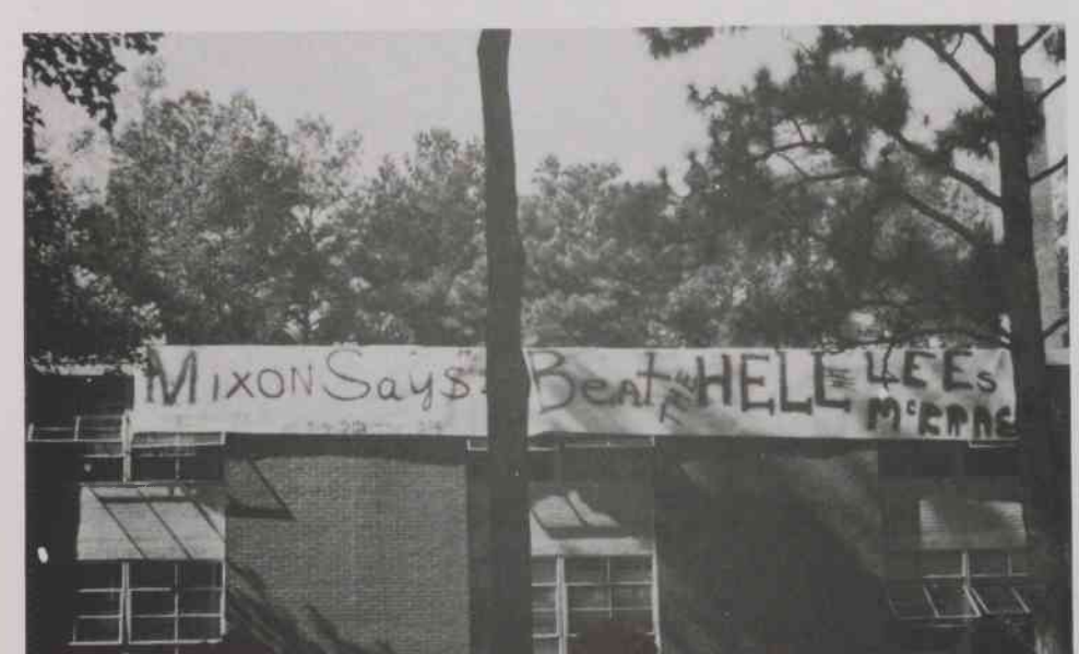
TELLS IT ALL—The banner displayed by residents of Mixon Hall revealed the story for the Chowan Braves when they met the Bobcats of Lees-McRae for the annual Homecoming football classic. The Braves handed Lees-McRae their first defeat of the season.