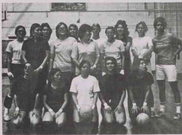
Chowan's 1974 Volleyball Team

All persons interested are instructed to meet under the bridge, the first car leaves the starting line at 4:00 pm. Anyone may enter, a speedometer and navigator are required. The competition is open to all cars, trucks and motorcycles. This will be a time, speed, distance event, not a race. The course will be short but challenging. An entrance fee will be charged. Cash awards will be given to the winners.