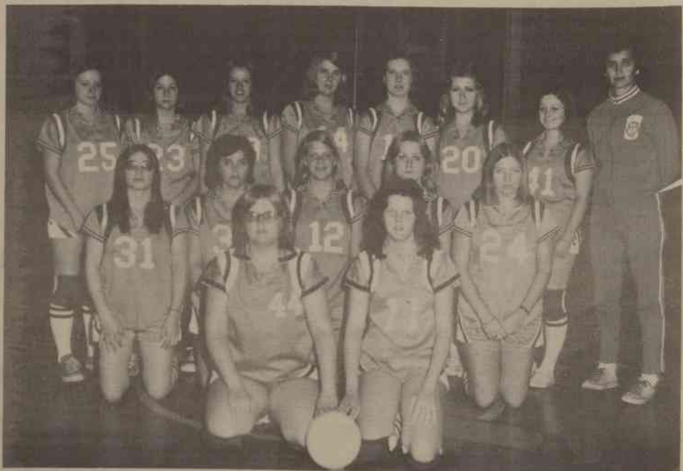
The Lady Braves Volleyball Team