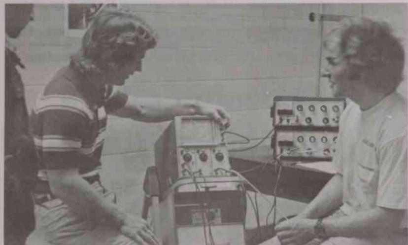
Physics students created interesting designs as part of Science-Mathematics Day.