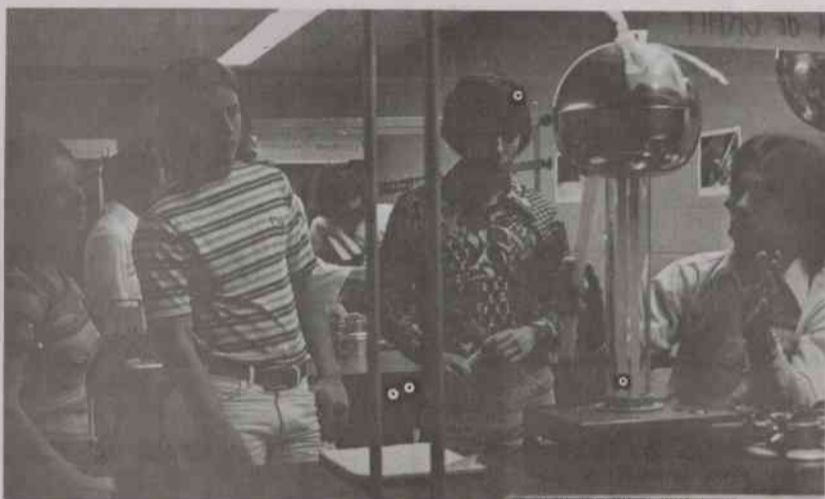
This is not the laboratory of a mad scientist but one of the physics experiments performed for visiting high school students during Science-Mathematics Day in Camp Hall March 5.