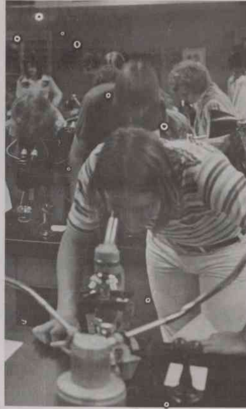
The biology demonstration gave the visiting high school students the opportunity to look at "strange things" under the magnifying glass.