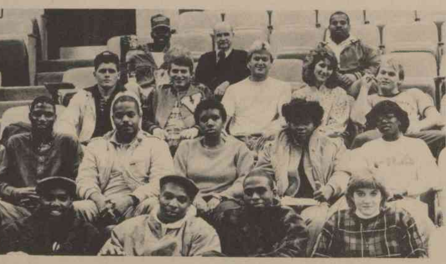
1986-87 Social Science Club

A Special Event sponsored by the Social Science Club