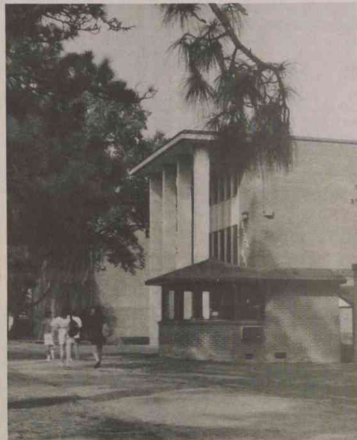
Girls return home to Belk hall.