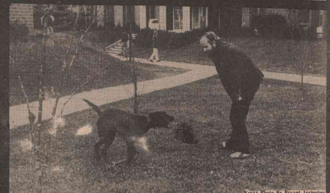
Essay