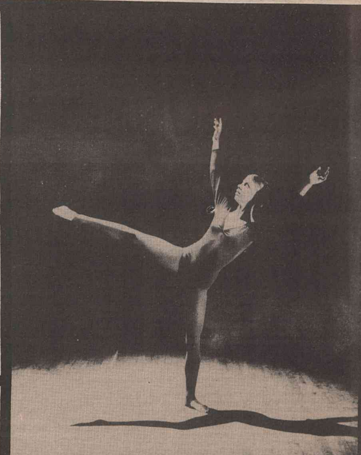
Essay

HOLIDAY DANCE - Saturday, Dec. 28, 8:00 p.m. in the Arts Council Rehearsal Room, Hanes Community Center. Sponsored by Winston-Salem Dance Forum. Call 725-6079.