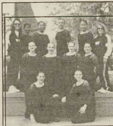
Monarch dancers at Walt Disney World.