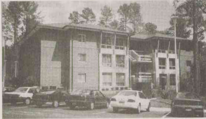
Students enjoy the suite style of living.

For students who have been familiar with calling the apartments be-