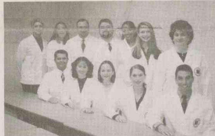
Future PA's look forward to Master's program.

Also, incoming students with all their prerequisites completed will no longer need to attain 27 credit hours at Methodist College before gaining admission into the program.