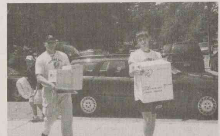
The Monarch Movers were more than glad to help out.