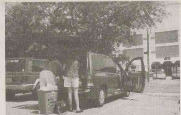
Just one of the few steps to a great college room.

With the overall increase in students who pursue a professional degree today, one wonders whether this first graduate program at Methodist will act as a pilot for others. We wish the P.A. Program's new educational endeavor great success.