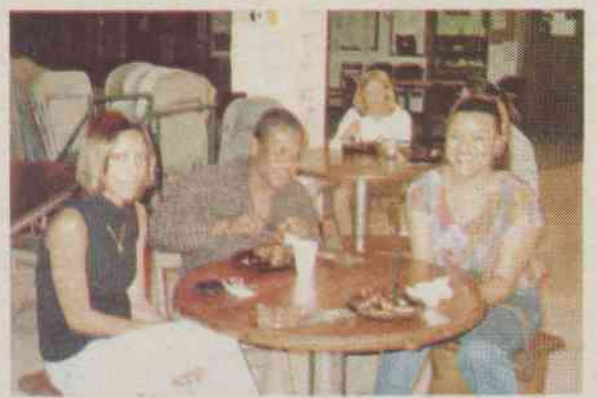
Contributed Photo A group of friends enjoying some ribs

Some students were able to participate in the demonstra-