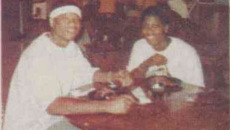
Good food with good friends makes a good time.

Over all MC Late night was successful. Students came dressed in their western wear and just had a good 'ol time.