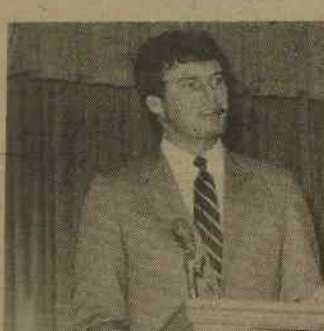
The Honorable Smedes York, Mayor, City of Raleigh.