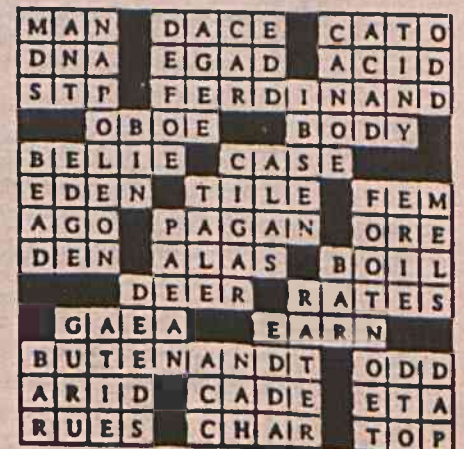
Answers to September/October Crossword Puzzle