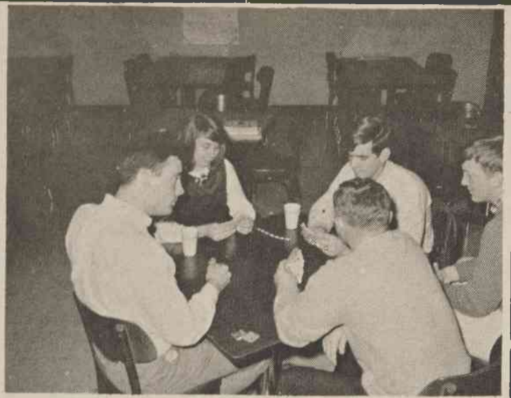
Favorite sport at Wesleyan—Bridge.