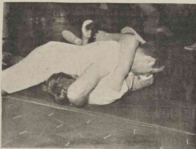
Who's winning this one?