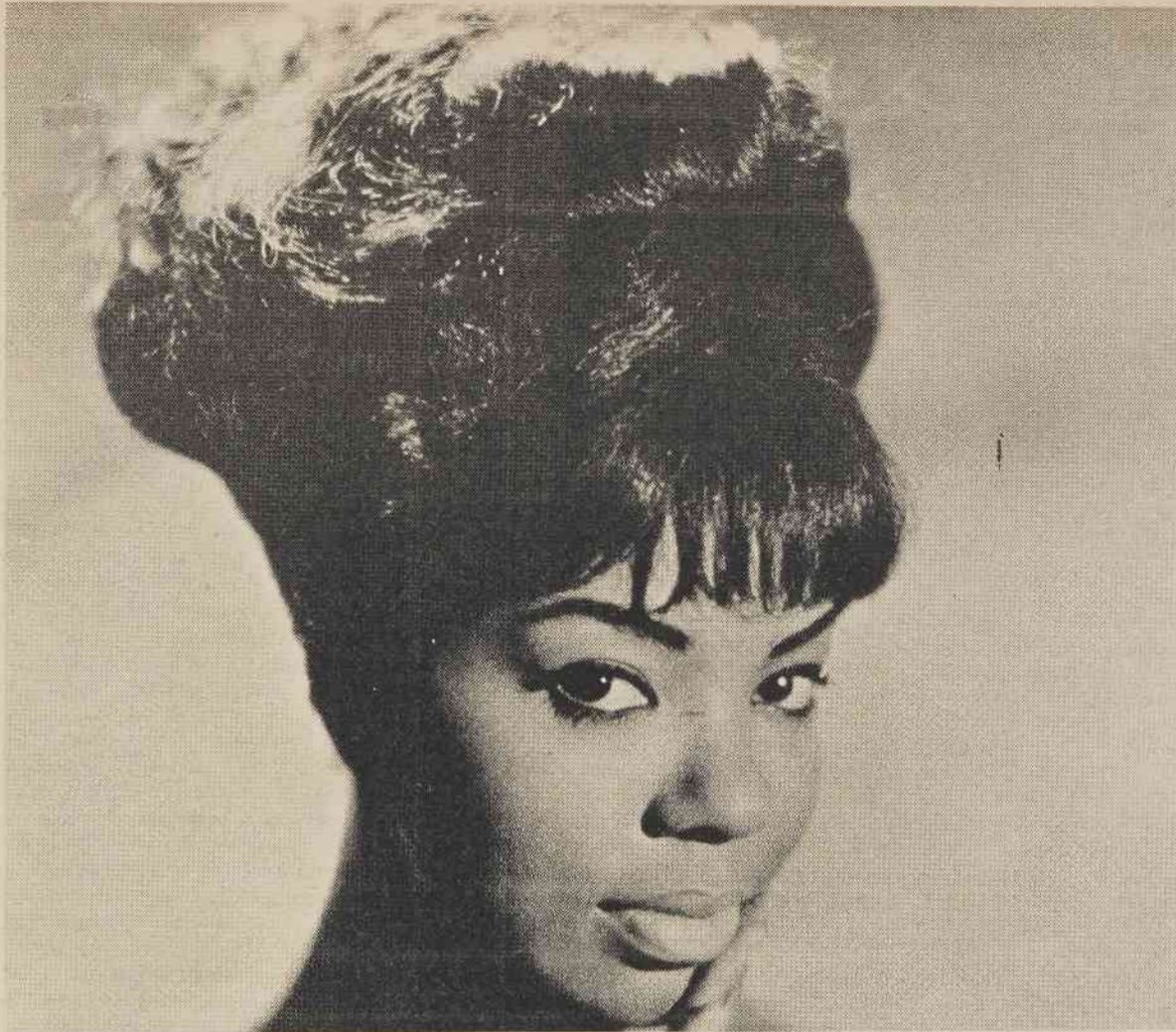
MOTOWN REVUE star MARY WELLS will headline the weekend's features as North Carolina Wesleyan College observes its first Homecoming Weekend, December 16-17.