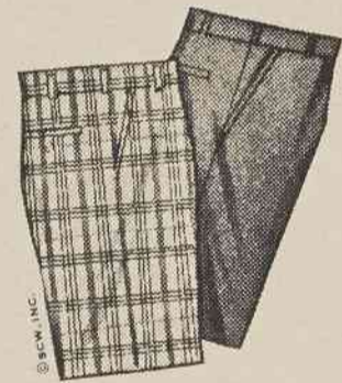
WALKING SHORTS in plaids, solids . . . With or without matching belts.