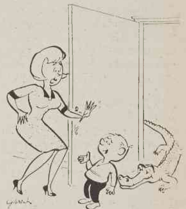
"Aw, he seems friendly enough, Mom—Lookit that big smile—"