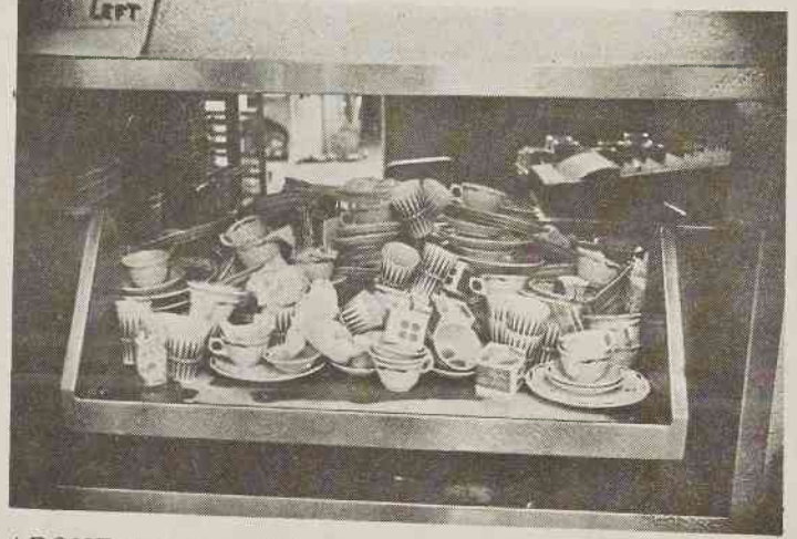
ABOVE: Unwashed dishes left by early-leaving student workers in Wesleyan Cafeteria.

student workers traced their dissatisfaction to the Cafeteria management, although some did indicate that they were ashamed to