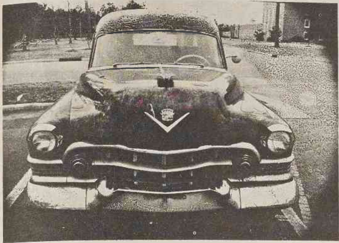
ABOVE: APO's new, used hearse.

Deadline for nomination, according to Mowbray, is midnight tonight, Friday, February 7.