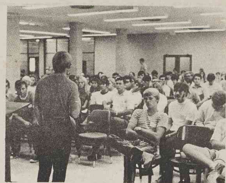
During a meeting with the Freshmen, organizations offer opportunities to get involved.