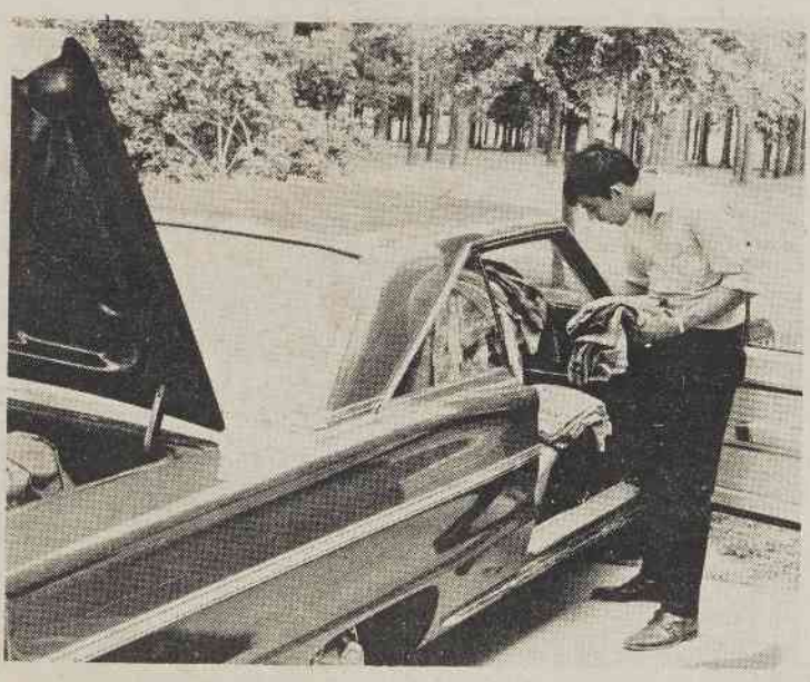
An arriving Freshman begins to unpack.