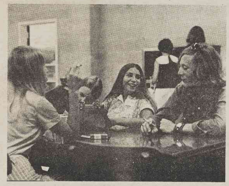
New students relax at lunch and get better acquainted.