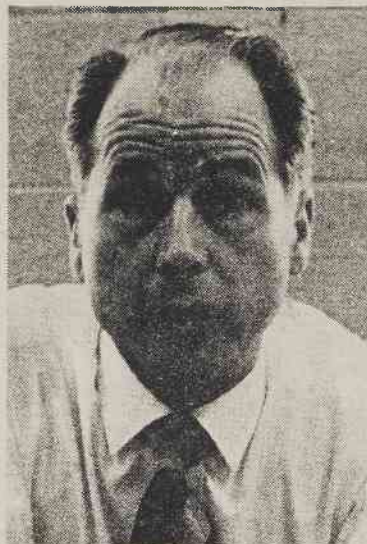
"We can create a successful Wesleyan Community . . ."

DECREE: What are your objectives for this year?