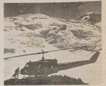
NICE VIEW... A 3rd Armored Cavalry HUEY helicopter is silhouetted against the ice packs of Mount Rainer. The chopper was used to resupply Ft. Lewis troopers participating in "Adventure Training."