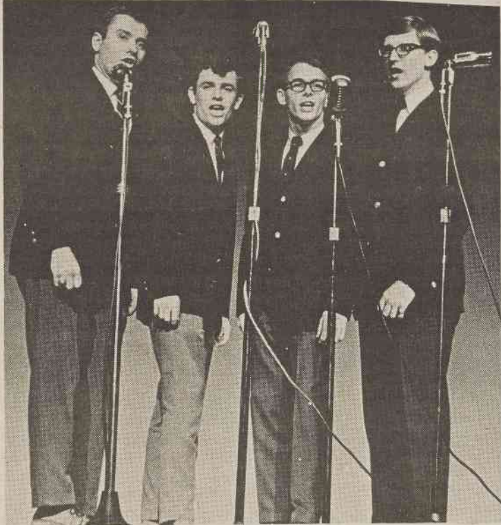
This mod group, FISH, will sing (?) or play (?) at Wesleyan's '72 Spring Flop.