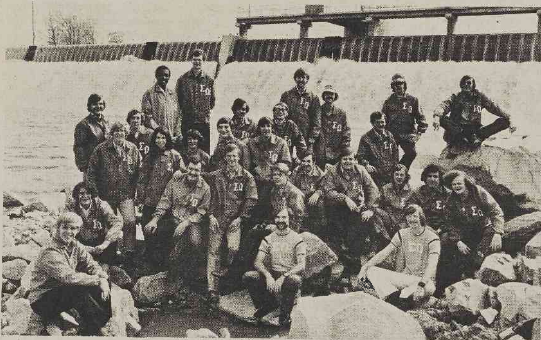
SIGMA OMEGA FRATERNITY

On January 31 of 1971, seven young men got together to form a new fraternity for the Wesleyan campus. That fraternity was to stress three major points: a strong fraternal attitude, academic knowledge, and service to the campus and community.