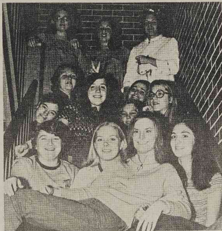
SIGMA PHI DELTA SORORITY