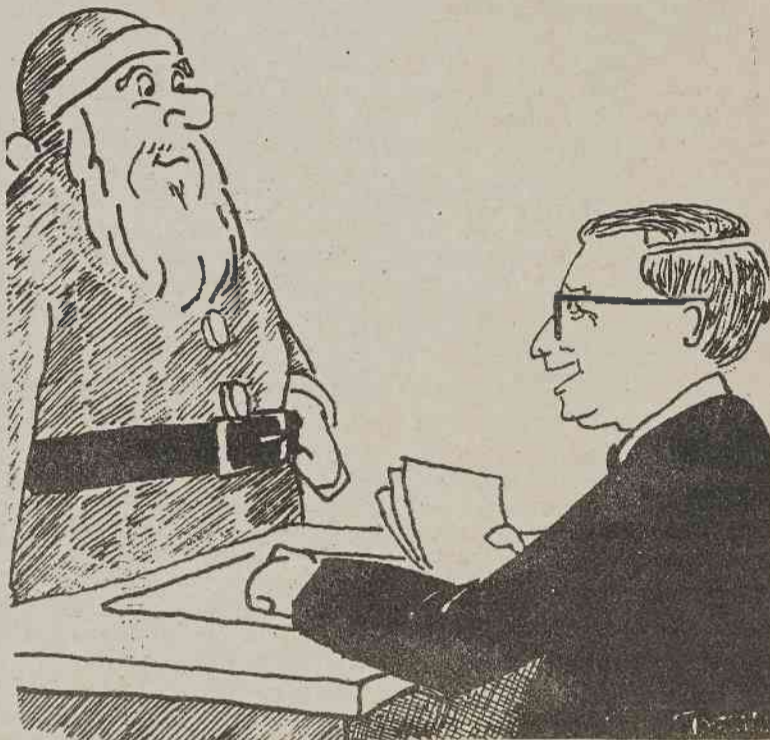
Your employment application seems in order, Sir. We're placing you with our Religion Department.