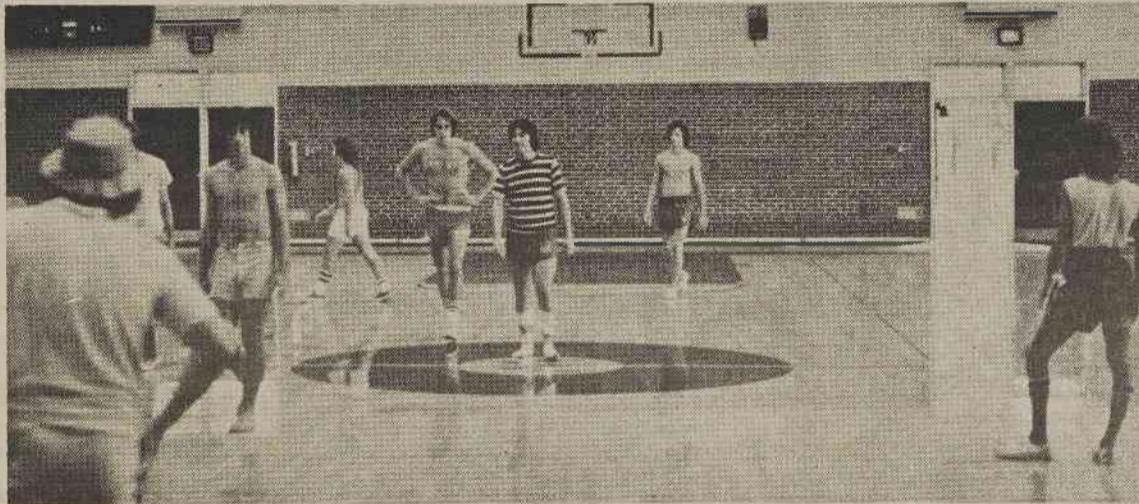
Nu Gamma Phi nears the 15th hour in their attempt to set a new world record.

The fraternity was seeking cash pledges for each hour of the Nu Gamma Phi Marathon and donations at the door, the sum total was approximately $600.