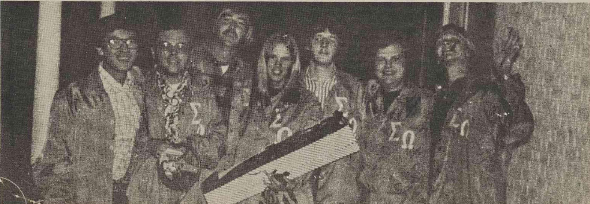
SIGMA OMEGA FRATERNITY

If you feel that you would enjoy getting to know about Sigma Omega, come to the Sig-O lounge the night of January 21 or ask any Sigma Omega brother.