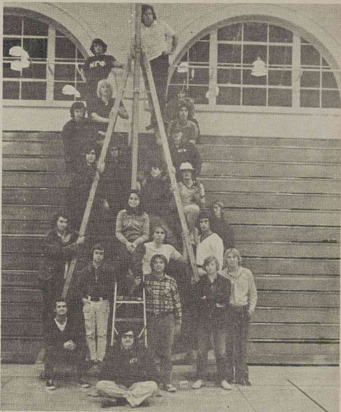
NU GAMMA PHI FRATERNITY

Nu Gamma Phi is all these: social-oriented, service-minded, and successful. But most important, it is a brotherhood—a group of diverse individuals bound together by the principles of brotherhood. Rush week is the time during which you can look at the brotherhood and it can look at you. We hope that you will take a look at what we are, what we have been, and what we could be with you as a brother of Nu Gamma Phi.