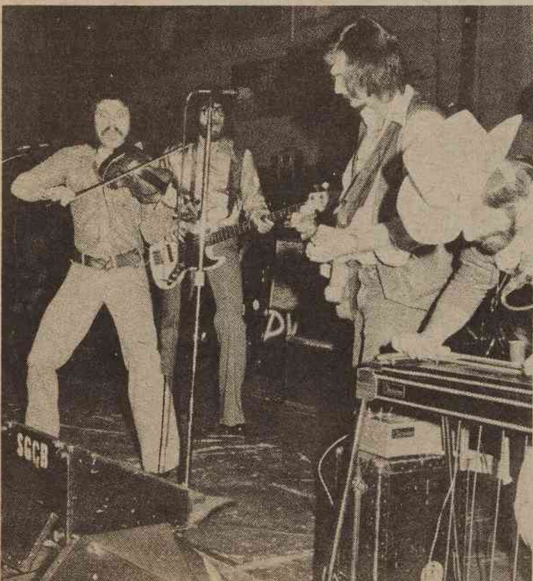
SUPER GRIT WARMS THE CROWD