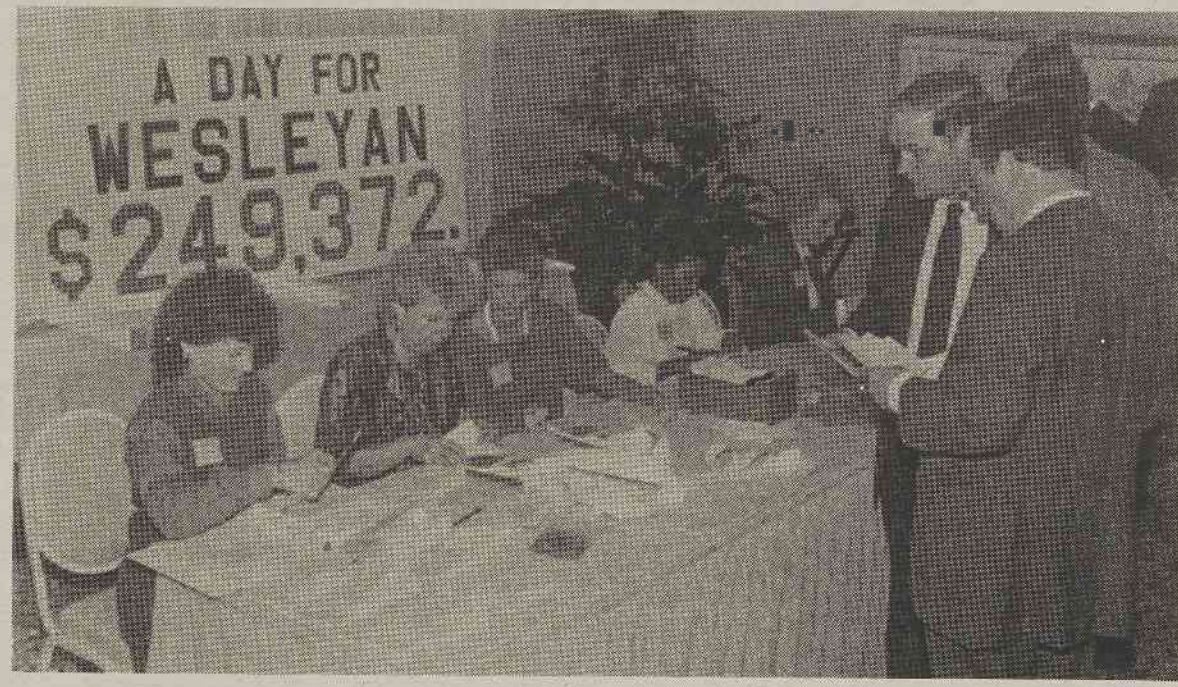
BIG DAY FOR WESLEYAN — Volunteers count pledges during the Sept. 9 "A Day for Wesleyan" fundraising campaign, which this year raised $316,785 for the college.