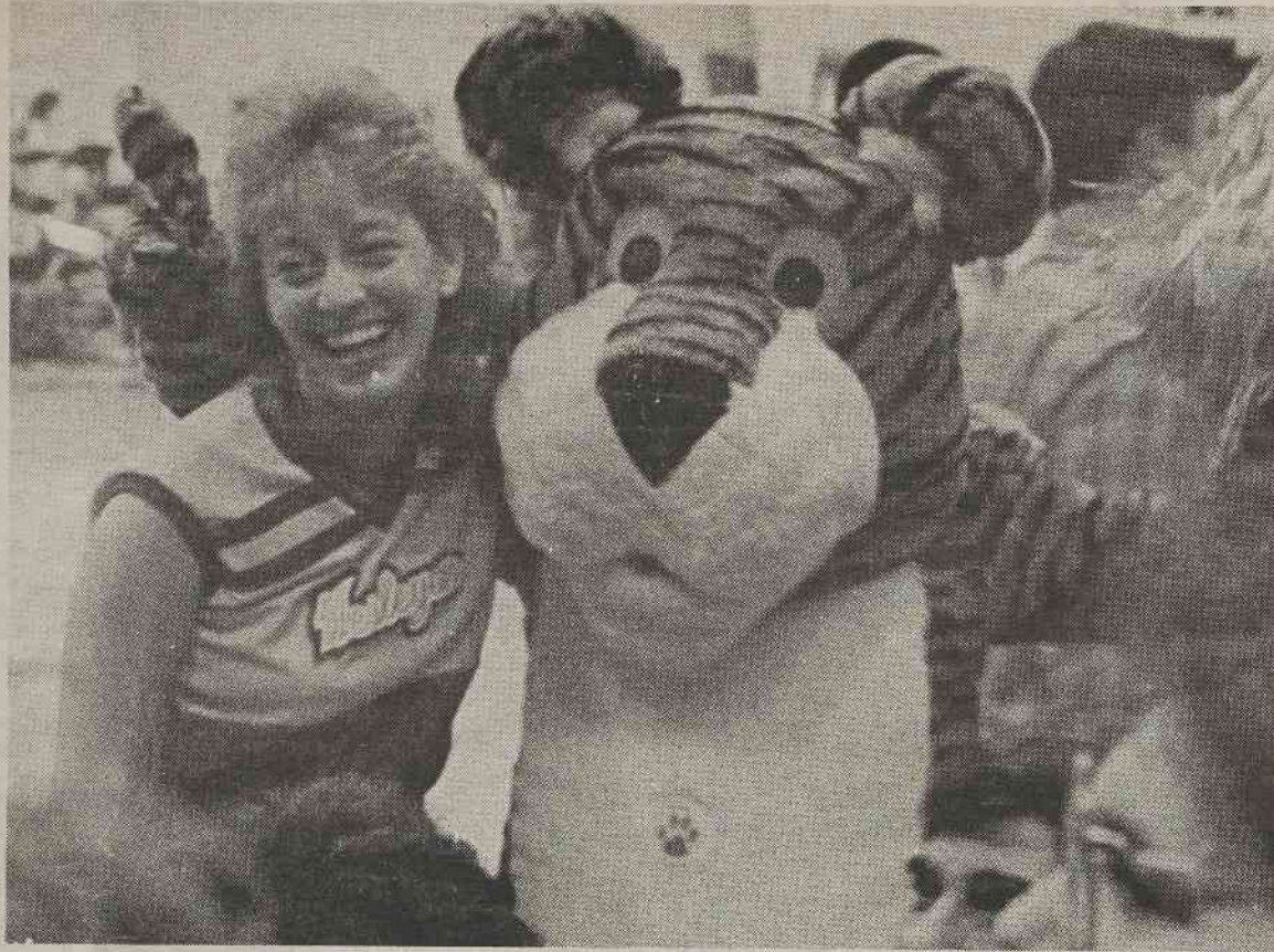
BISHOPS' CHEERLEADER TAMES WITTENBURG TIGER