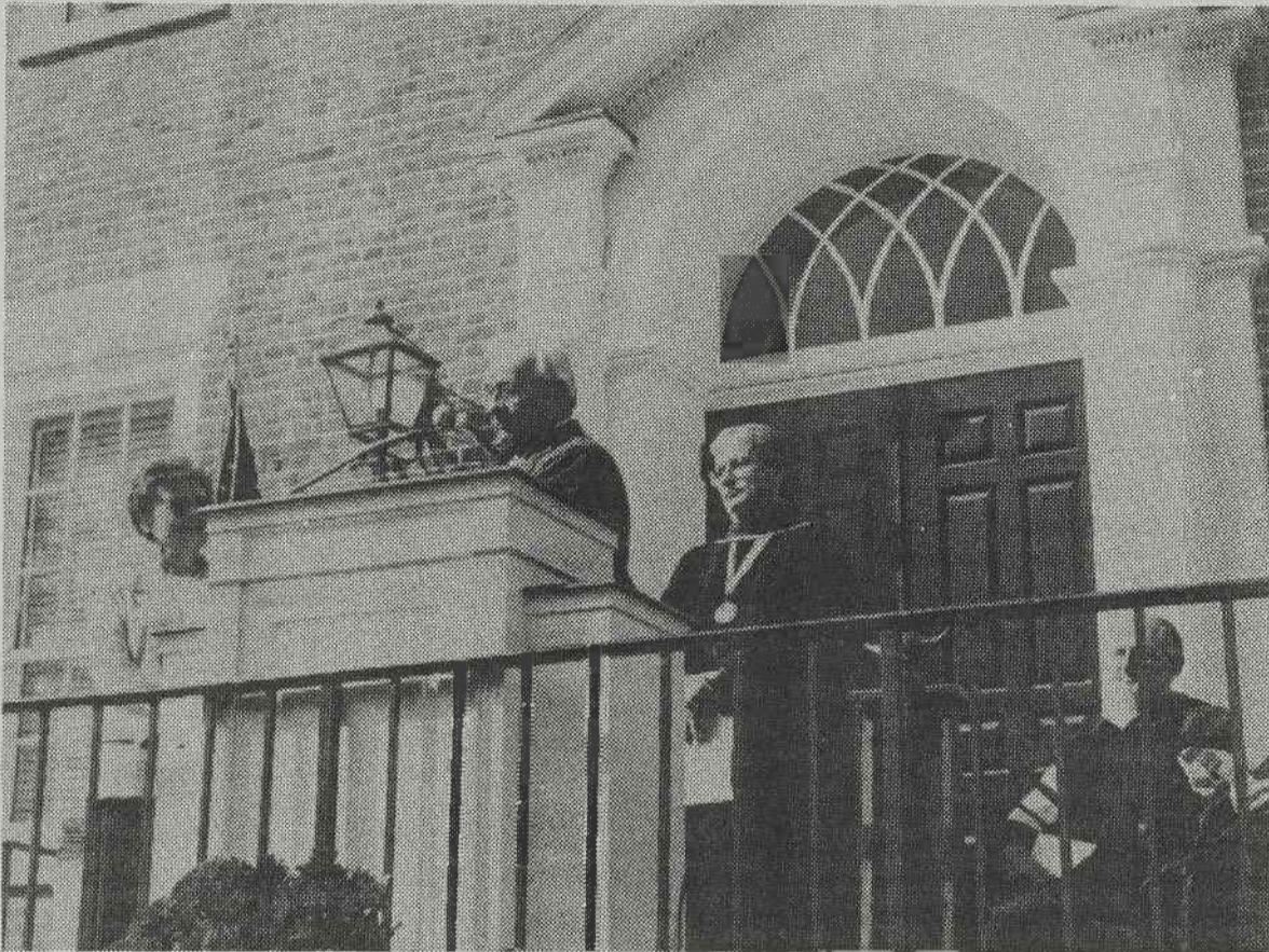
FOUNDER'S DAY CONVOCATION HONORED WESLEYAN'S FOUNDING IN 1968.