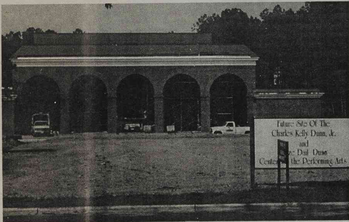
EXTERIOR IS ALMOST COMPLETE FOR FINE ARTS CENTER.