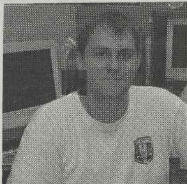
Professor of English/Journalism and Adviser of The Decree .