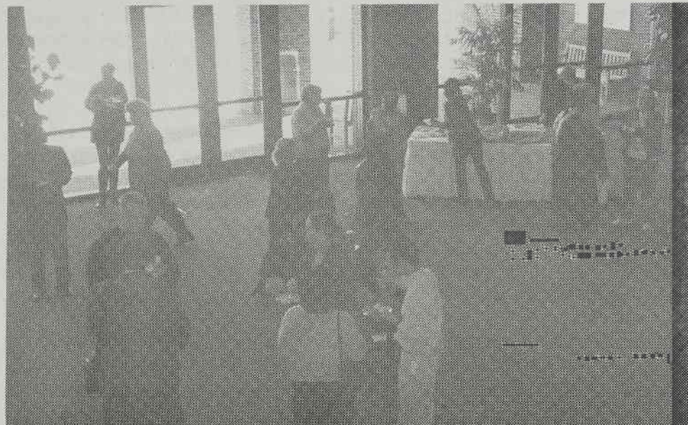
Students, Faculty and Guest gather in the loby of the Dunn Center