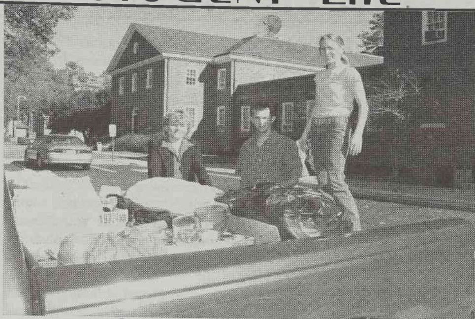
On the way to My Sisters House

DECREE CLUB MEETINGS ARE HELD EVERY MONDAY FROM 11:30AM - 12:30PM, AT THE DECREE OFFICE IN THE HARTNESS STUDENT CENTER, AND ARE OPEN TO ANYONE INTERESTED IN HAVING A VOICE IN THE CONTENT OF THE DECREE.